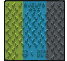
Cover available in any RAL colour