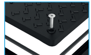
Watertight and secure due to 4 bolt security compressing the EPDM seal

Bespoke locking bolts available to provide increased security on critical networks