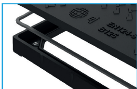
EPDM seal fixed to the frame for water and odour seal