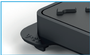
Ductile iron frame for added rigidity