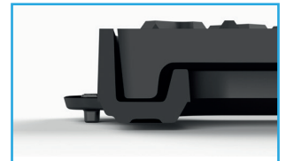
Frame with single seal groove to help prevent odours escaping from the chamber