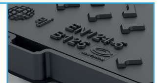
Third party certification to EN 124-5:2015 by the NSAI