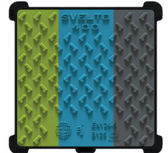
Cover available in any RAL colour