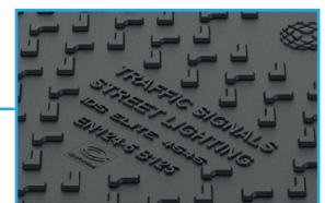
Third party certification to EN 124-5:2015 by the NSAI