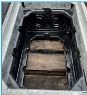
Cover and frames are compatible with our DATUM range of chambers