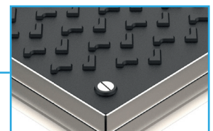
Durable stainless steel locking screw for harsh environments