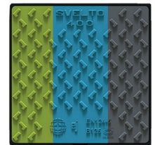
Cover available in any RAL colour