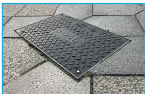
Rigid steel frame, in 100 mm depth to suit block paving installs