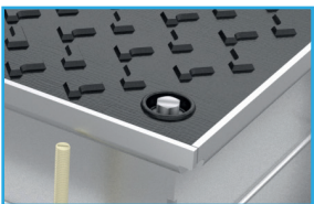
Cover locked with 4 hexagon V2A screws

Bespoke locking bolts available to provide increased security on critical networks