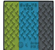
Cover available in any RAL colour