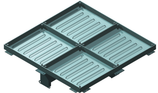
4 Part Plan Example

Multiple recessed tray type cover and frame. Designed to be infilled with C25 concrete to achieve full loading. Recessed lids are designed for either full concrete infill or concrete infill with upto a 15 mm tile floor finish. Trays are locked with M10 Allen Head screws as standard. PS3650 units are fitted with a centre removable beam and intermediate beamwork. All products are manufactured under an ISO 9001 Quality system. This product is hot dip galvanised to BS EN ISO 1461 as standard.