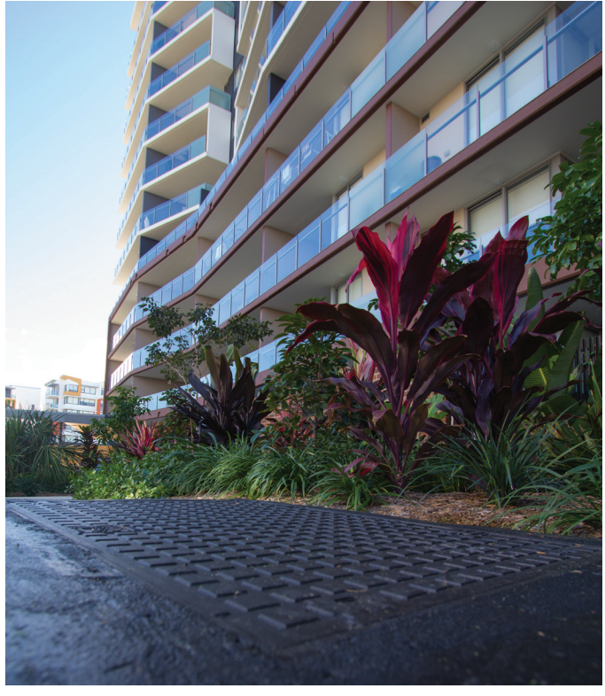
Pedestrian-friendly covers and grates at Pradella's Light + Co. Apartments, West End.

More and more, contractors and builders are specifying complete suites of EJ access covers and grates for use in and around apartment projects. Near Brisbane-city West End is burgeoning with a myriad of developments that feature not only apartment living, but complete lifestyle ventures complete with pools, gardens, gyms and even retail precincts.