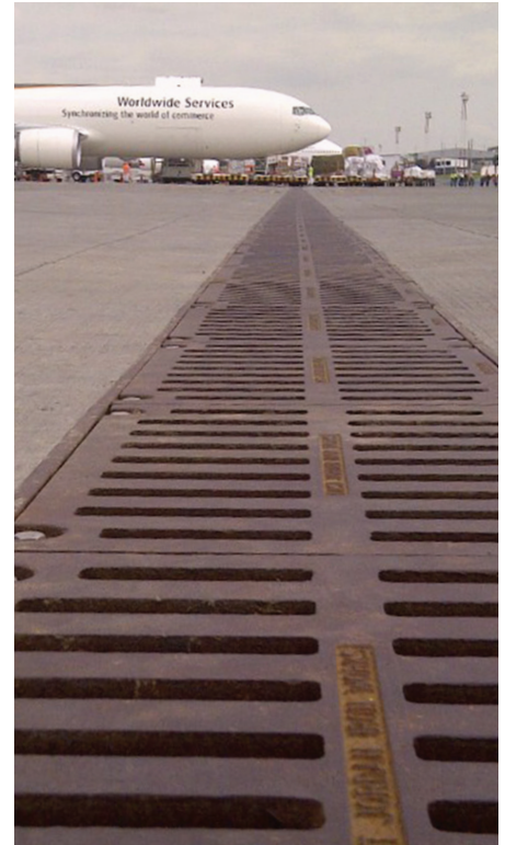
On board this year: Hinged Hatch Cover, Top Flange Grate and Frame and Airport Mooring Eyes.

You might wonder how an access cover can be deemed to be action-packed. If it's EJ, it can. Our Class G ductile iron cast hatch covers come complete with easy operating features like gas-lift assist hinged hatch lids. And guess what? You'll be invited to have a play with these covers as well as our wide range of other access covers and grates from the world leaders in airport infrastructure solutions. It's all on display at the Australian International Airshow 2017 at Avalon Airport, Geelong, 3rd to 5th March.