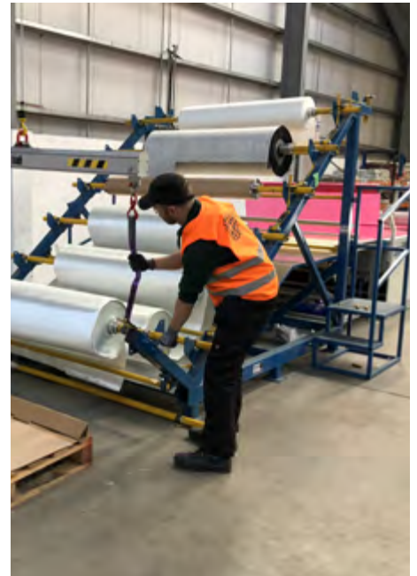
Preparing the fabric reinforcement on the automated cutting machine

By regularly investing in our plant and equipment, and adopting a continuous investment strategy, we confirm our commitment to be the world leader in infrastructure access solutions.