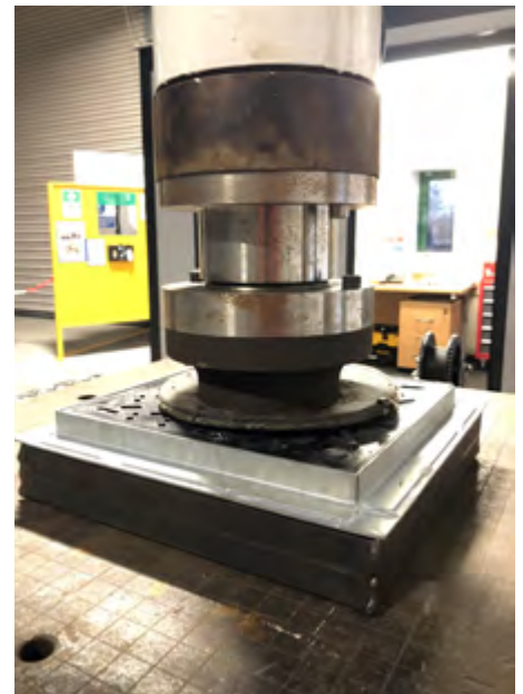
Testing the load bearing capacity at the Birr composite facility

What this means for our industry is that there are many ways to construct a product and call it a 'composite'. Given the potential for such a variety of products, it is important that stringent standards are in place. On the next page, we'll consider EN 124:2015 in a little more detail.