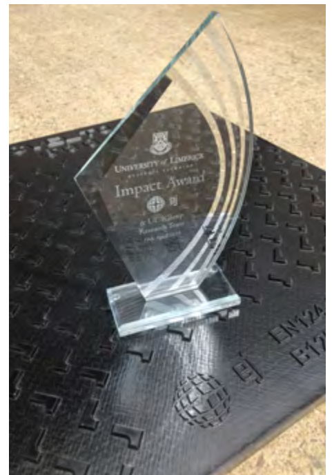
2018 Impact Award