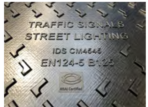
Badging on the EJ IDS range of covers