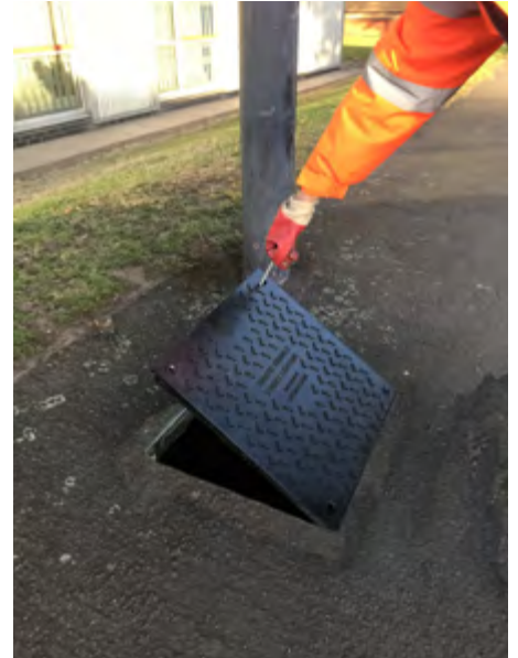
Ease of handling

While composite products offer many advantages, how composite products are made and what standards they are produced to, can vary widely - and this is the primary reason why the European standard was expanded.