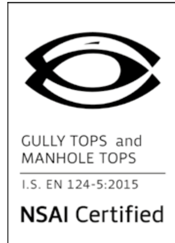
Figure 1 NSAI Certification mark

As industry leaders, we commissioned our own research and testing to demonstrate our commitment to the standard and to ensure all requirements are met.