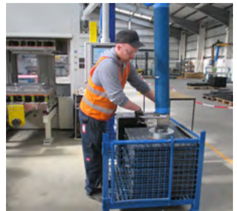
Demoulding at the European composite facility, Birr, Ireland